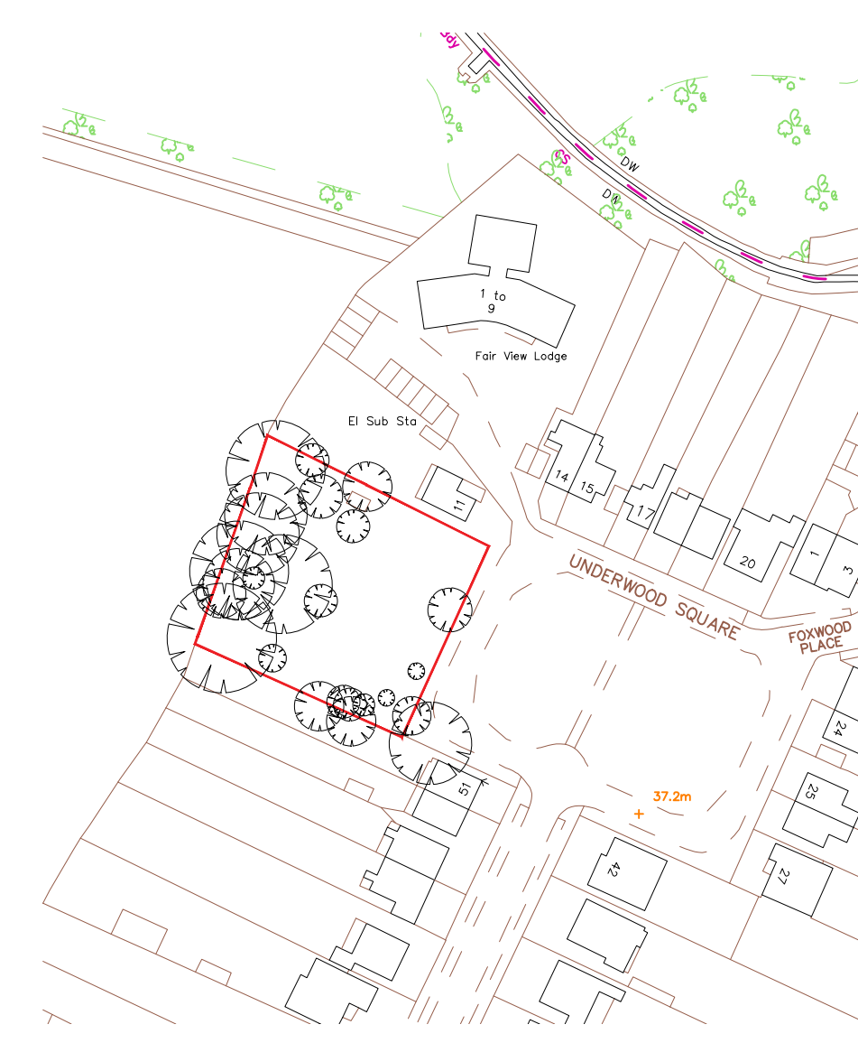
Existing Site Plan - 1:1250

Pre-Existing south (side) elevation 1:100